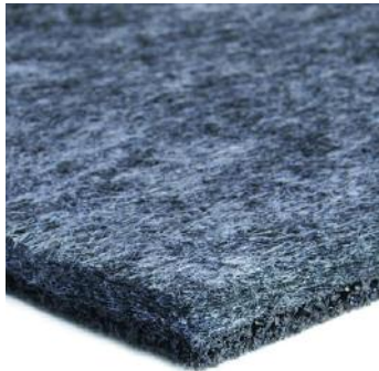
Duralay Kensington Deluxe

Duralay Kensington Deluxe is a new, high performance crumb felt combination underlay ideally suited to woven carpets. The 11mm thick underlay comprises two layers: 6mm of recycled charcoal grey felt provides comfort and “beds in” to the carpet backing, and a 5mm layer of high quality crumb rubber offers a durable and hard-wearing support for the carpet.